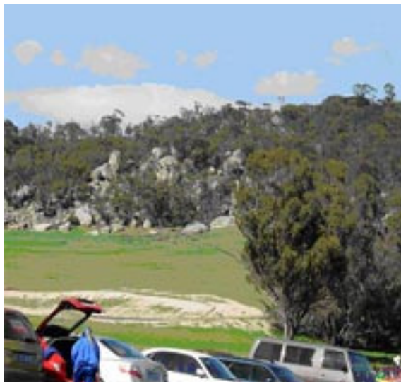
Spot the control in the rocks.