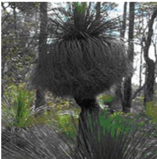
A Black Boy or Grass tree

'I reckon next time I go orienteering in Australia I will develop better strategies for managing trees (and rocks).'