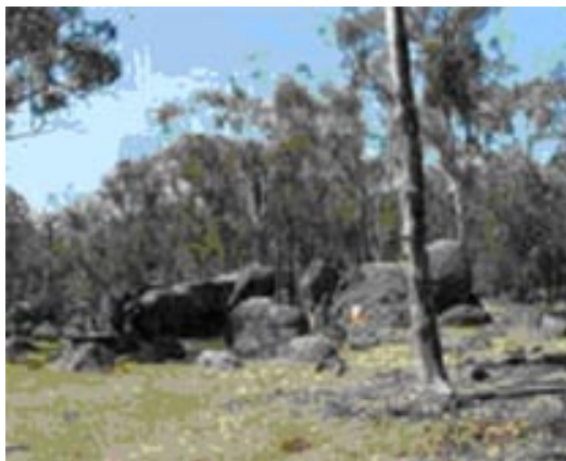
Typical granite rock cluster

Never been to Perth before, here is a good opportunity. Wow, it's a long way away from NZ but with a few air points and a bit of creative airfare planning, trip planning was soon underway.