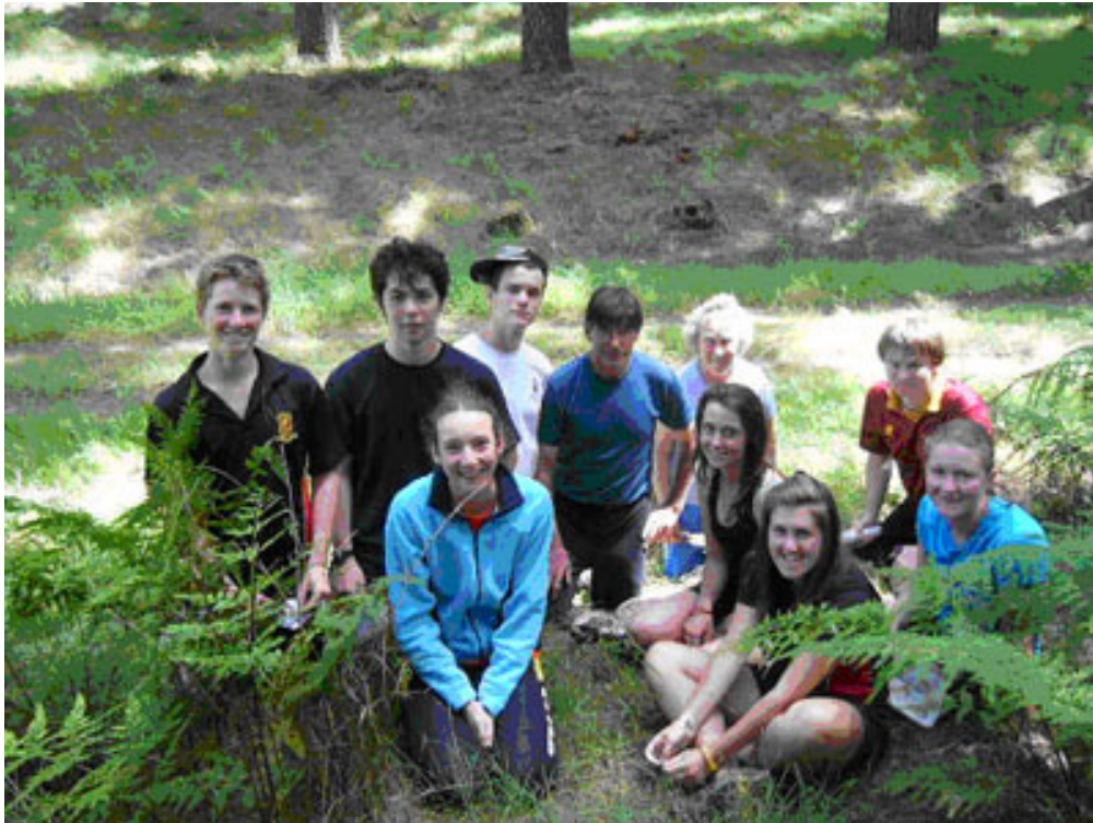
The CMOC squad at the NZOF's Junior Training Camp

After finding our controls (toilet paper) everyone was keen to get back to camp and have showers. Only one bad thing was that there wasn't enough hot water for everyone. Dang! But to end on a good note, today was extremely good in the sense that everyone learnt so much and that everyone got the hang of contours. Man, doesn't it feel really good knowing you've got your plan right? Feels awesome!